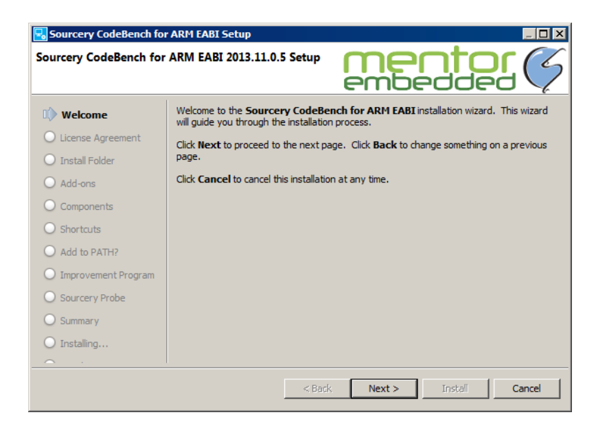
Running the Installer. The graphical installer guides you through the steps to install Sourcery CodeBench Lite.

You may want to change the install directory pathname and customize the shortcut installation.